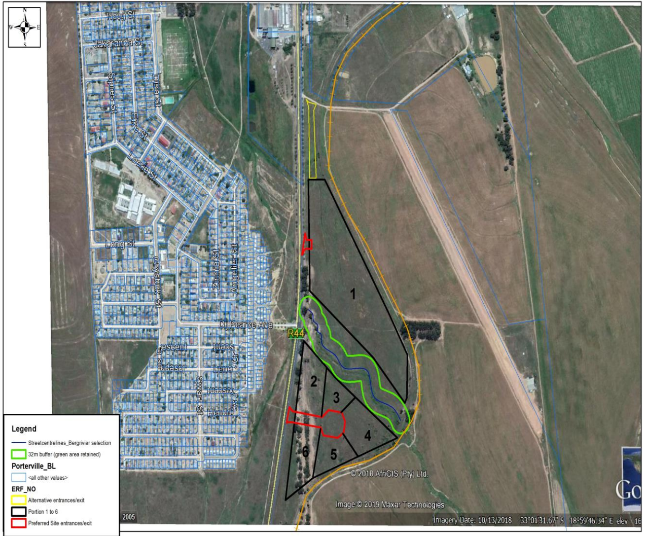
Map B: Indicating the alternative option: Possibility of an alternative entrance/exit from the existing gravel road to the North of the site for Portion 1 on the Site Development Plan.