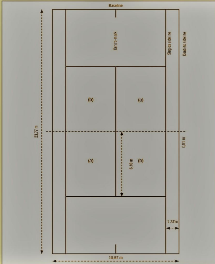
Tennis court dimensions