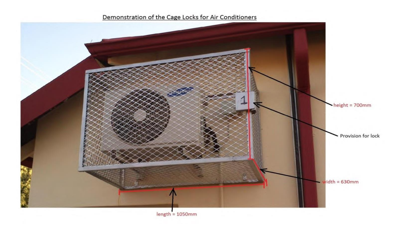
ABOVE IMAGES IS FOR ILLUSTRATION PURPOSES ONLY