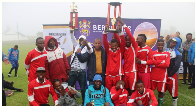
Caption: Young Stars FC were crowned as the champions of Division B and bagging a cash prize of R8 000.