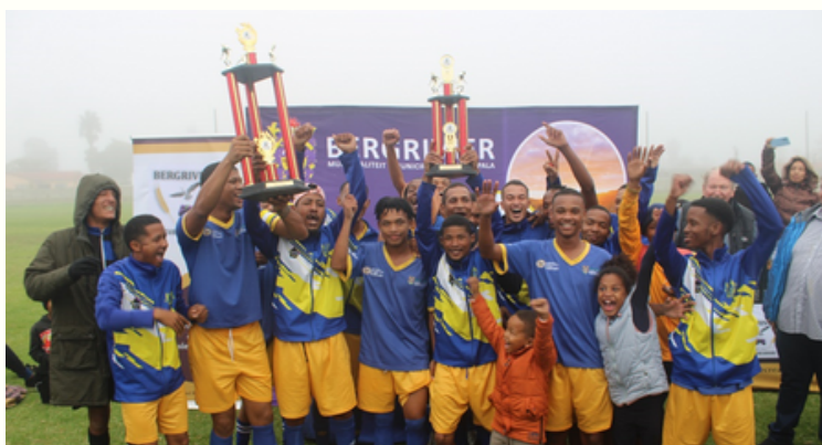
Caption: Atlantic Rovers FC (Velddrif) were the winners of Division A at the Bergrivier Mayoral Soccer Cup 2023.

The tournament consisted of two divisions, namely Division A (South African Breweries League) and Division B (Local Football Association League). The final rankings for Division A (from top) were Atlantic Rovers FC (R8 000); Yizo Yizo FC (R4 000); Young Chiefs FC (R2 000) and Rasta Milan FC (R1 000), whilst Young Stars FC (R8 000) won Division B and in second place was Piketberg United FC (R4 000). Third place in Division B went to Porterville Hotspurs FC (R2 000) and in fourth was Piketberg Spurs FC (R1 000). Emotions were high as all teams battled it out to be crowned as the winners of the Bergrivier Mayoral Soccer Cup.