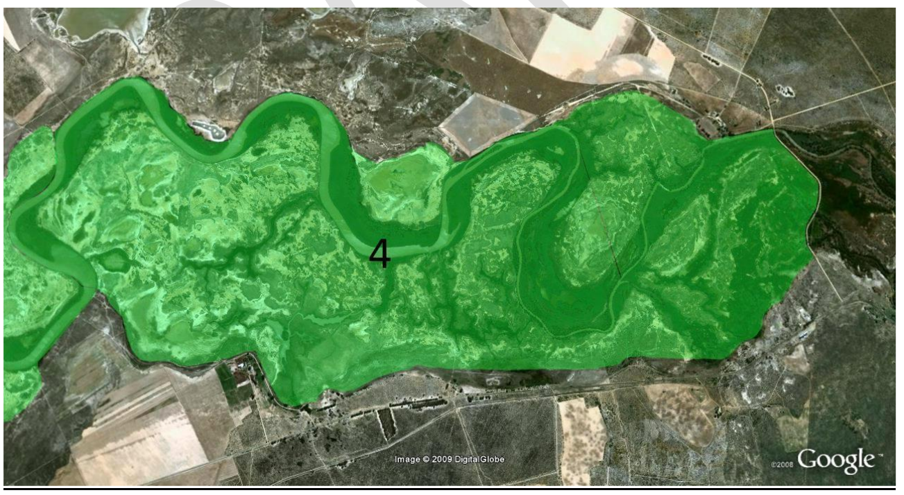
Zone 4 as far as is applicable to the Bergrivier municipal area