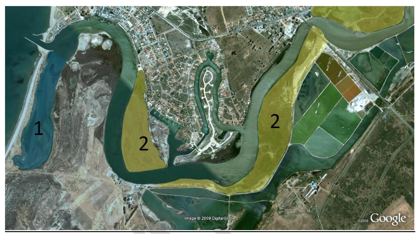
Special features and habitats on the Groot Berg River estuary for which additional protection is required. 1. Old Mouth Lagoon, 2. Intertidal salt marshes.